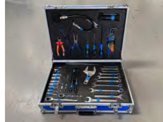
Service tool kit