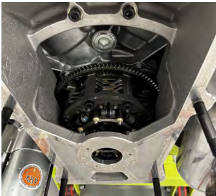
Anti-stall centrifugal clutch