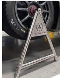
Hub stand set