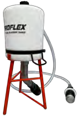
2" dry break refueling bottle