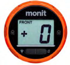
Digital brake bias adjuster