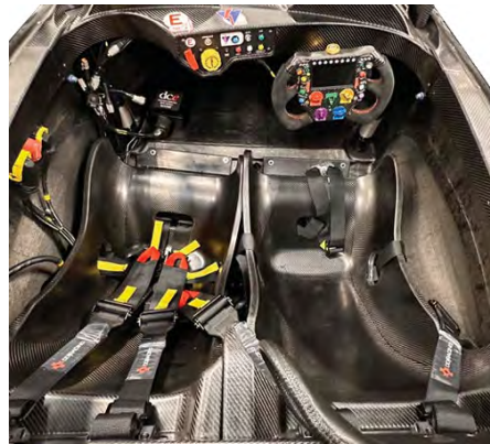
Passenger seat, harness and footrest